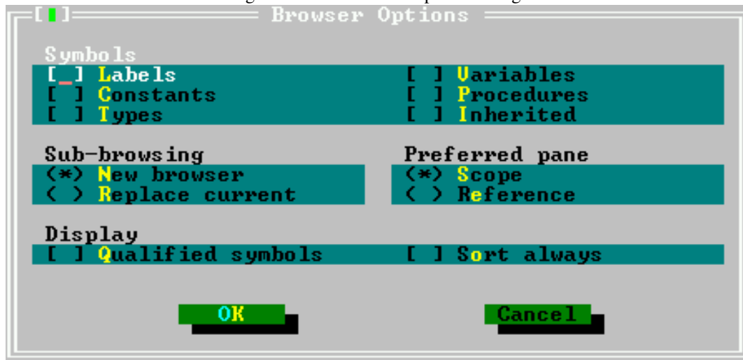
Figure 6.9: The browser options dialog.

Replace current The contents of the current window are replaced with the members of the selected complex symbol.